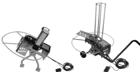
Do All Outdoor Traps

Telephone: (021)797 8787/ Fax: (021) 797 9102/ info@suburbanguns.co.za