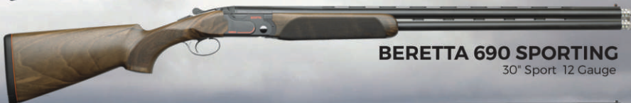
BERETTA 690 SPORTING