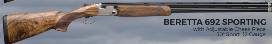
BERETTA 692 SPORTING

with Adjustable Cheek Piece 30" Sport 12 Gauge