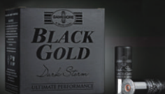
12G DARK STORM (250) 12GA 7.5 (28GRAM)