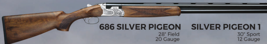
686 SILVER PIGEON