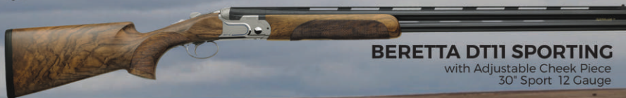
BERETTA DT11 SPORTING

with Adjustable Cheek Piece 30" Sport 12 Gauge