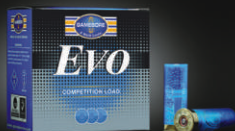
EVO COMPETITION (250) 12GA 9 (28GRAM)