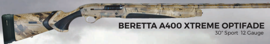
BERETTA A400 XTREME OPTIFADE