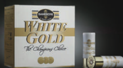
12GA WHITE GOLD (250) 12GA 7.5 / 9 (24GRAM / 28gram)