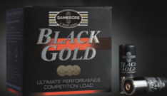
12G BLACK GOLD (250) 12GA 5 (34GRAM)