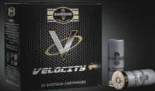
VELOCITY PLUS (250) 12GA 7.5 (24GRAM / 28GRAM)