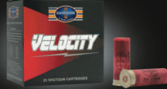
VELOCITY PIGEON (250) 12GA 6 (29GRAM)

JOHANNESBURG Rivonia Crossing II, 3 Achter Rd, Sunninghill Tel: 0861 14 35 45