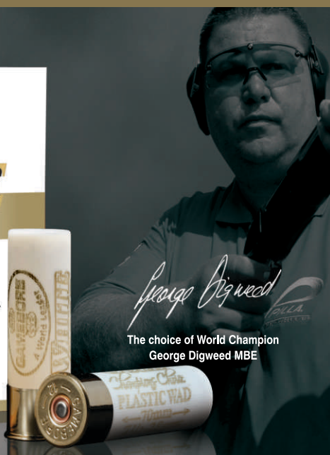
George Digweed The choice of World Champion George Digweed MBE